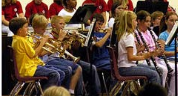
March is "Music In Our Schools" Month